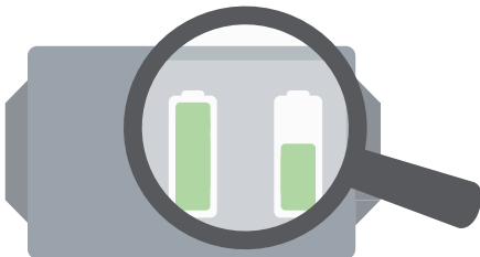
look inside a typical battery pack

The difference—Raffel's battery packs are designed using an exclusive balanced charging circuit. This makes the battery cells work efficiently together.